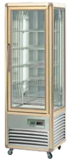
CONTINENTAL 350Q Wire shelves