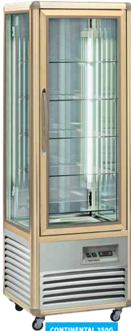
CONTINENTAL 350G Glass shelves