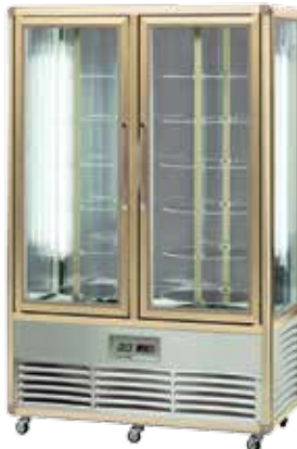
CONTINENTAL 700R Rotating shelves