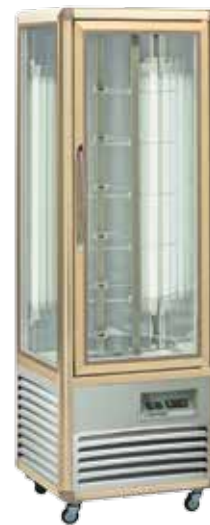
CONTINENTAL 350R Rotating shelves