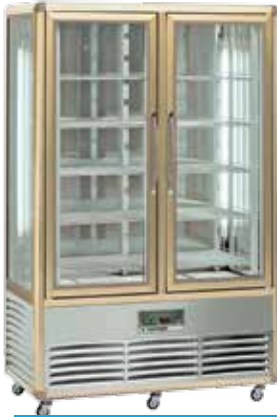
CONTINENTAL 700Q-Q Wire shelves